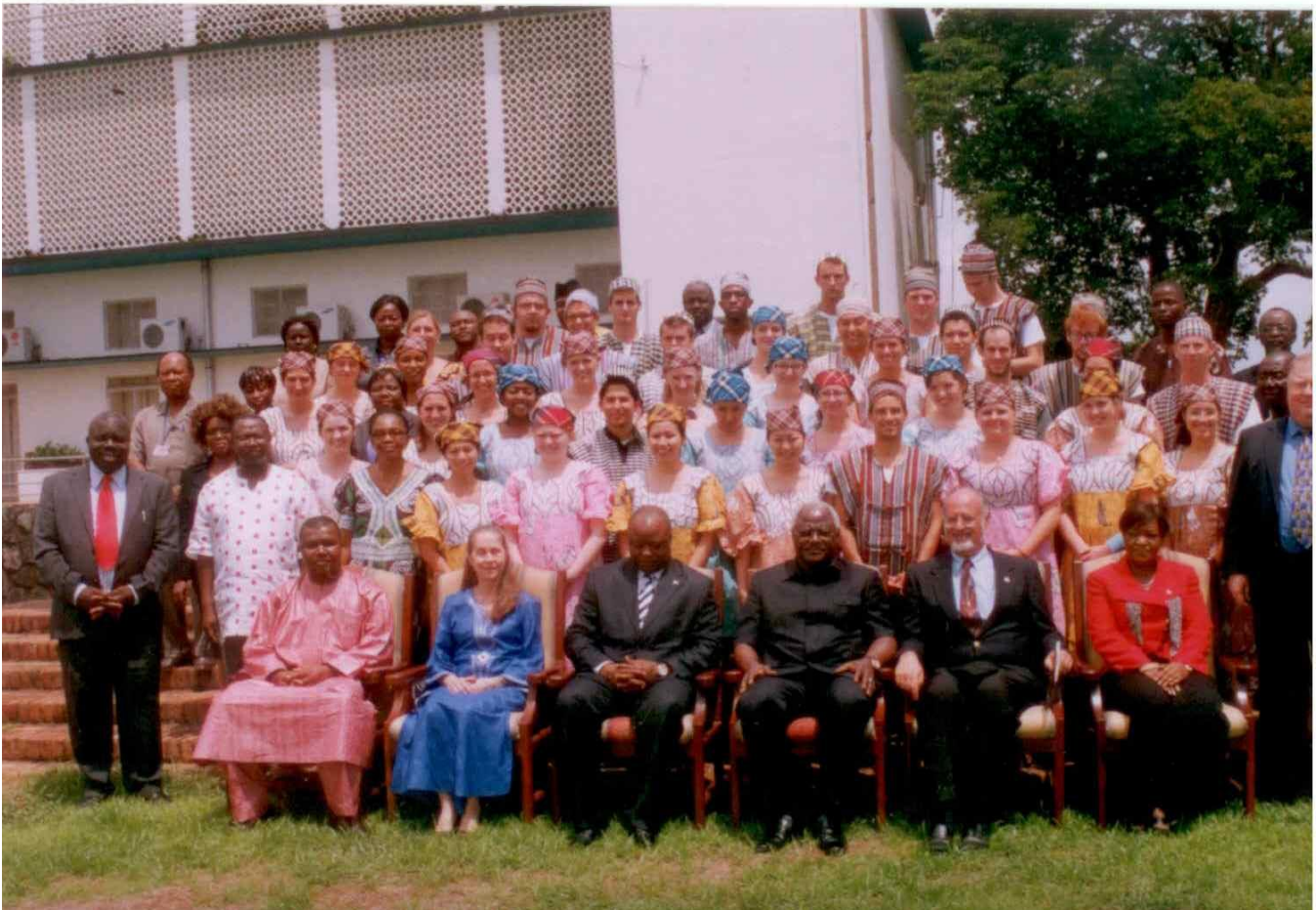
President Ernest Bai Koroma and the new crew of Peace Corps Volunteers in Sierra Leone.

Cell: 232-78-464-244 Email: jwallach@sl.peacecorps.gov