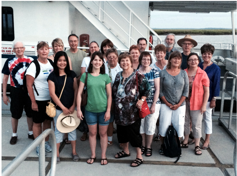
Annual Meeting 2014