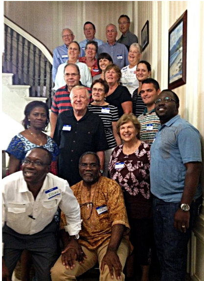
Annual Meeting 2015