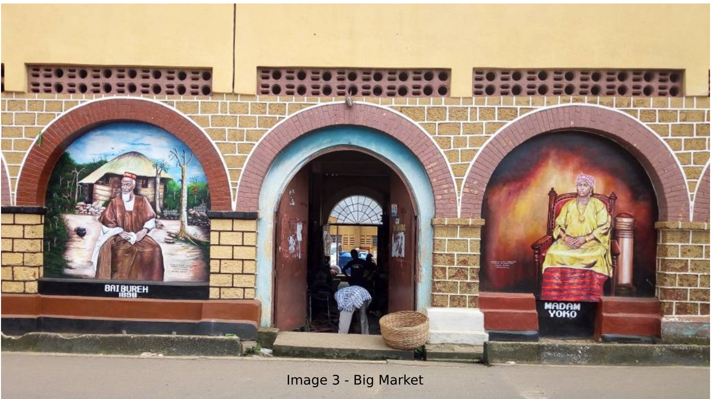
Image 3 - Big Market