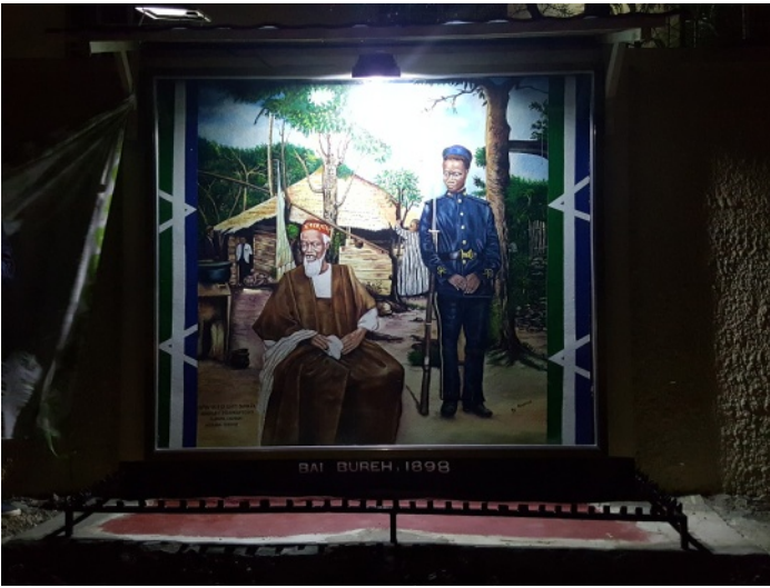
Image 2 - Bai Bureh