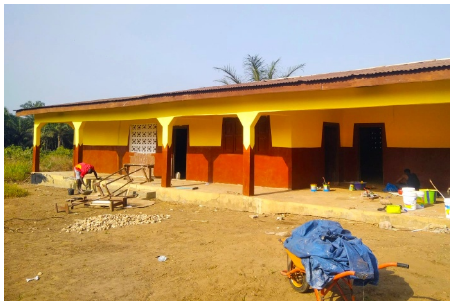
Women for Women of Sierra Leone Free Early Childhood School Building, Tower Hill, Yele