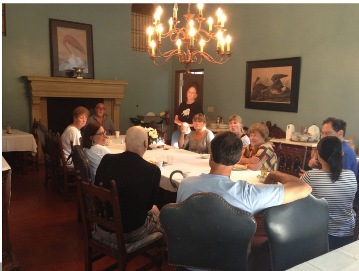
The dining room