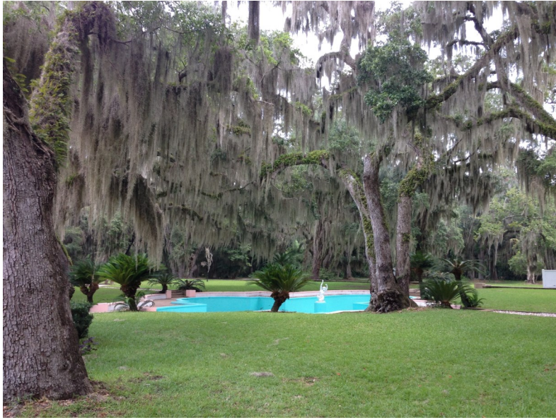
Live oaks from the mansion front veranda