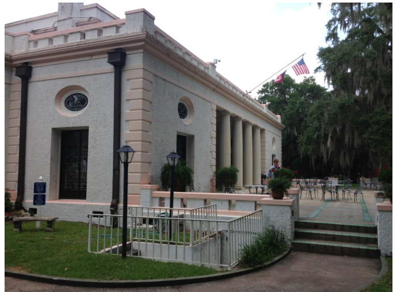
The Reynolds mansion.