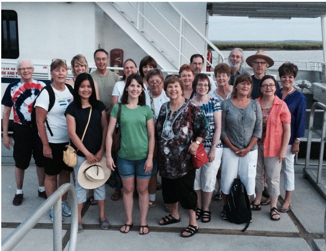
Annual meeting attendees on the ferry between Meridian and Sapelo Island.

There was mention of having the 2015 Annual Friends of Sierra Leone Meeting in Freetown next summer. More discussion on that later. We left to go home on Thursday afternoon.