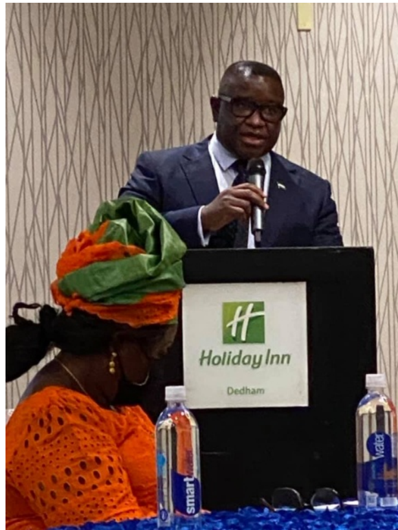
H.E. Maada Bio