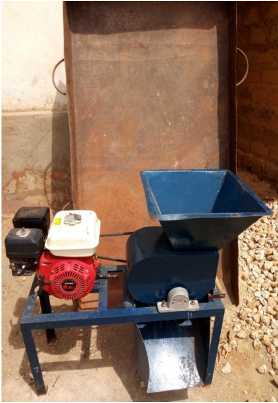
Garri roasting tray and cassava grating machine