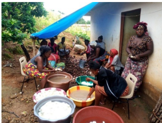
Peeling, washing, and cleaning cassava tubers for processing