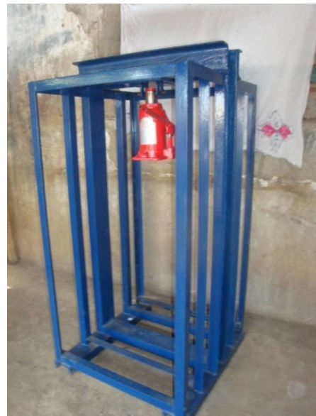
Cassava slurry presser / manual de-watering machine