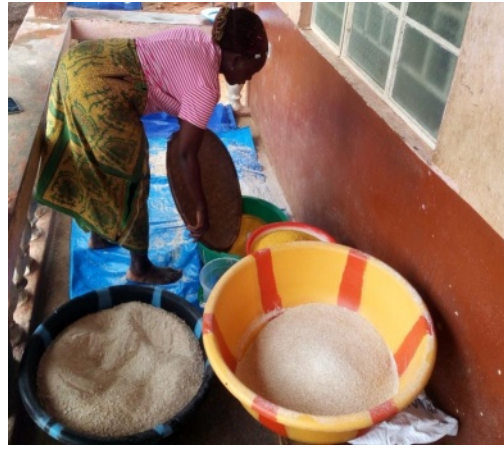
Sieving garri by manual method