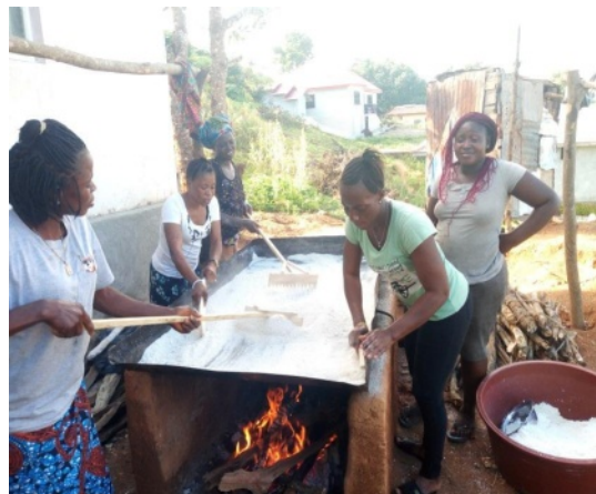
Roasting / frying garri by manual method