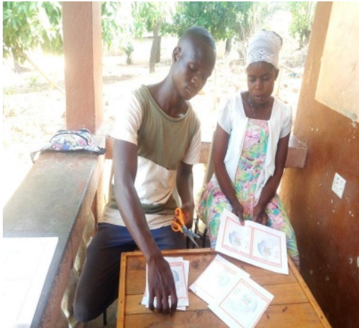
Labeling garri packages with our own brand by local method