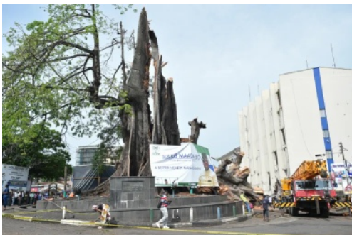
Freetown cotton tree has fallen.