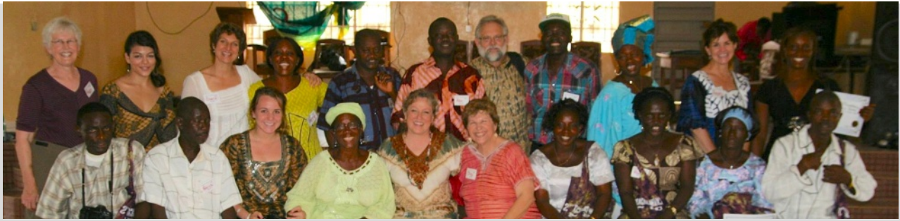
Bo Teacher Workshop facilitators, 2009