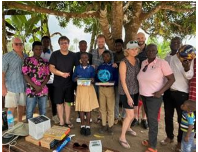
Poeske Family with students and staff