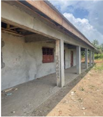
School Addition 1