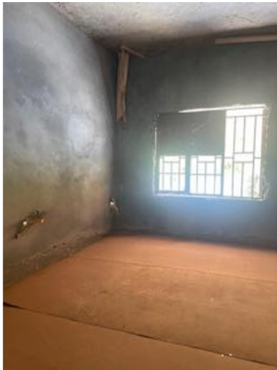
School Addition 2