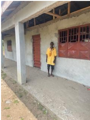
School Addition 3