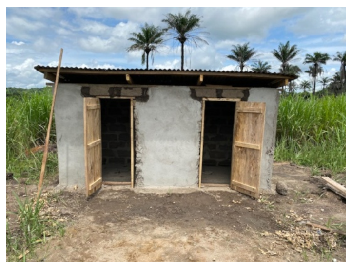
KDGO Toilet Project

Please visit our social media sites for more information, updates & photos of the projects we supported!