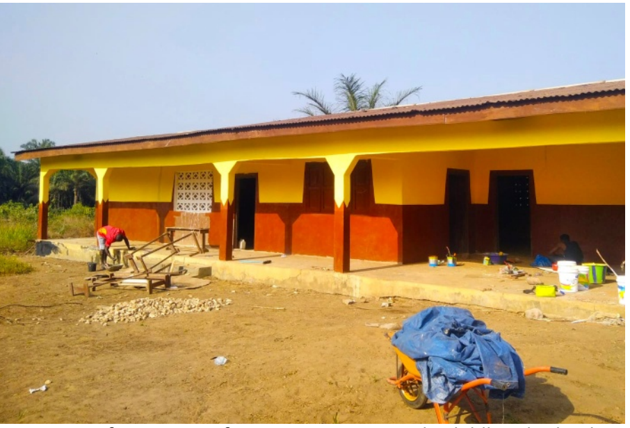
Women for Women of Sierra Leone Free Early Childhood School Building, Tower Hill, Yele